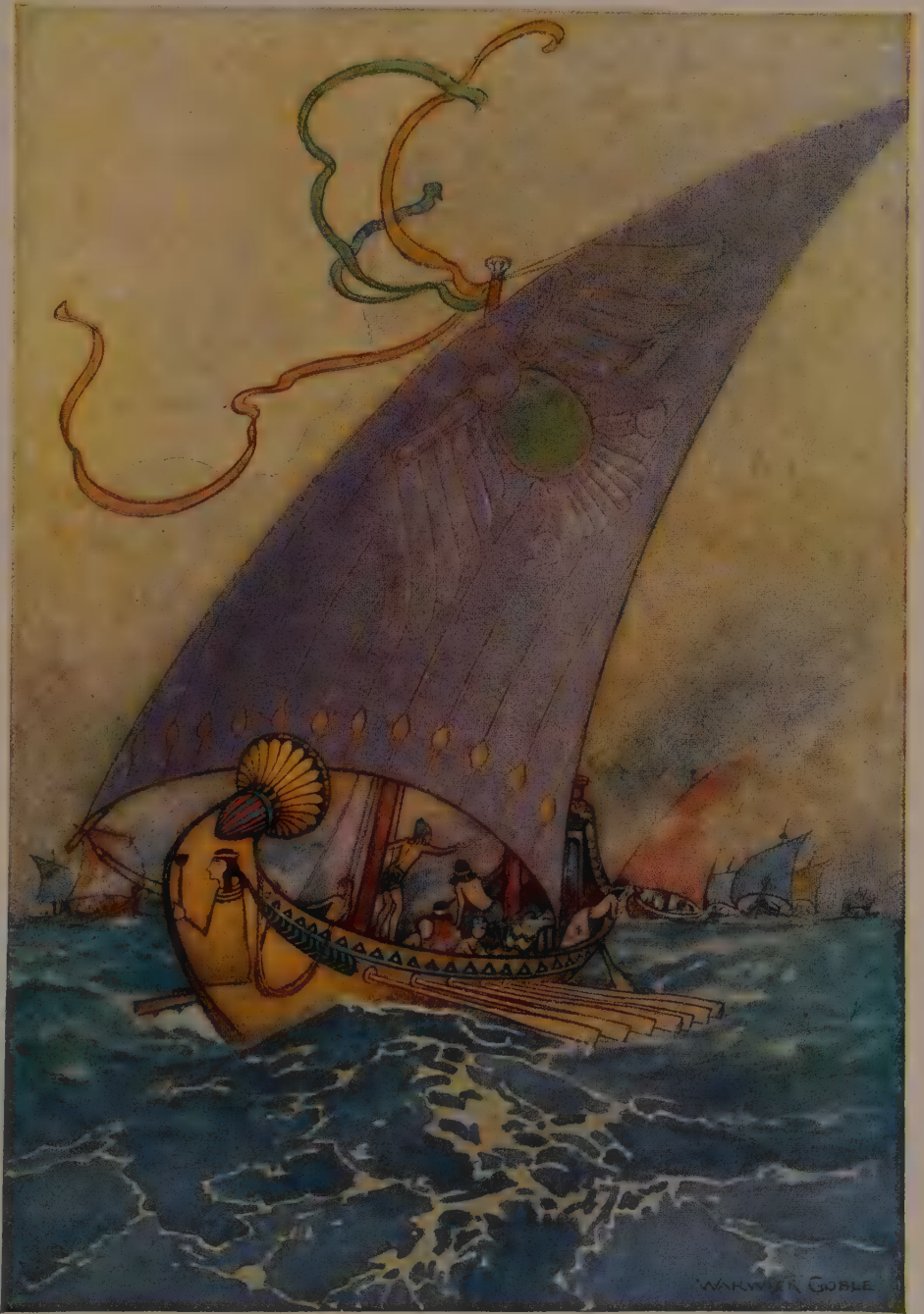
CLEOPATRA'S GALLEY AT THE BATTLE OF ACTIUM